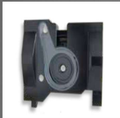
ROTOR HOUSING SC