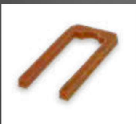
OIL FELT SE QQ