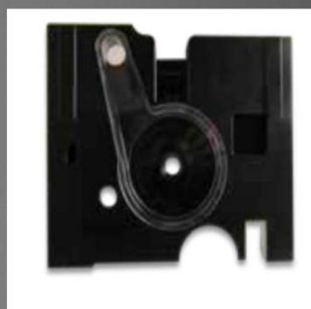
ROTOR HOUSING SQ 11/12