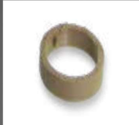
CLAMPING RING SE 7/8