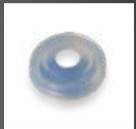
SEAL COLLAR SW 7-SQ8