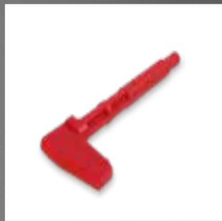
LOCKING LEVR SE9