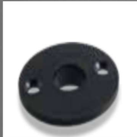
ROTOR SEAL SE 7/8/SQ8