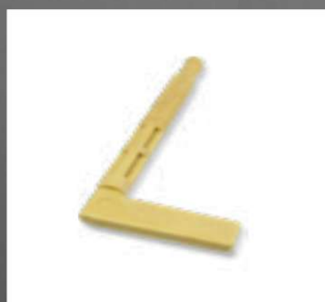
LOCKING LEVER SE 11