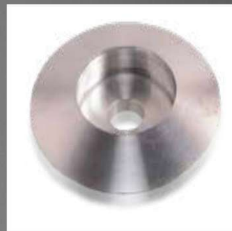
FLANED WHEEL SE 11-12