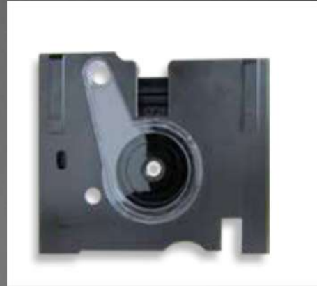
ROTOR HOUSING SQ 9