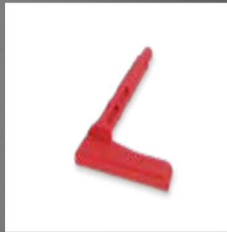
LOCKING LEVER SE 10