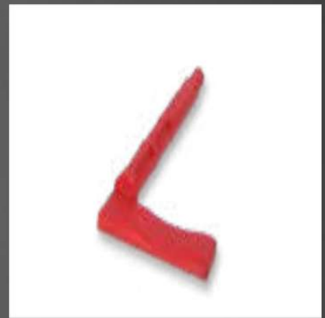
LOCKING LEVER SQ