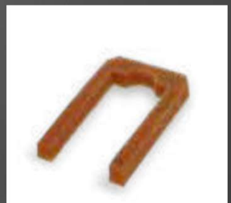
SEAL SE 11