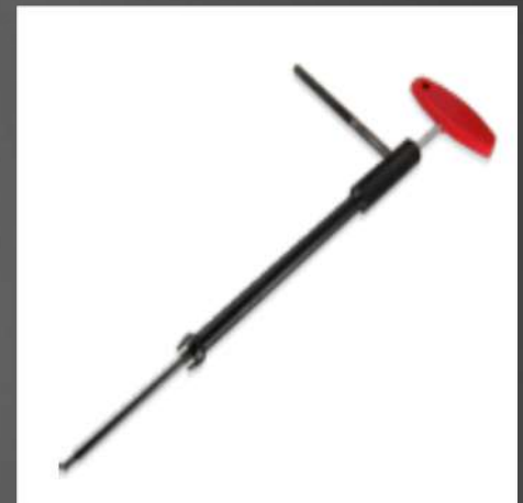
KEY ROLLER SUSPENSION