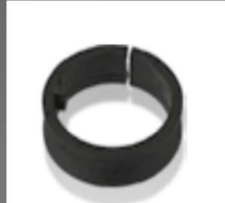
LAMPING RING 9-12 SC/SQ