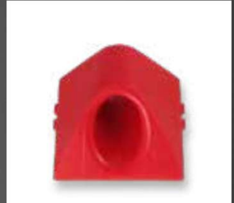
SILVER GUIDE SC