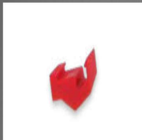
SUPPORTING PCS SE 8/9/10/SQ