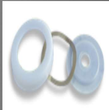
AIR SEAL SC