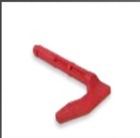
LOCKING LEVER SC