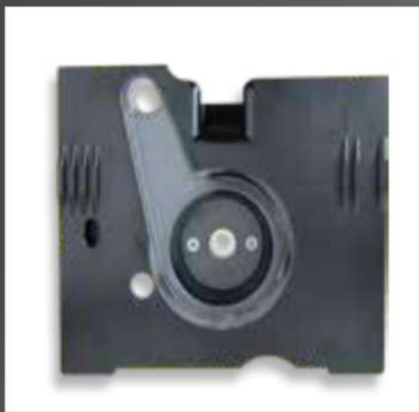
ROTOR HOUSING SQ 8