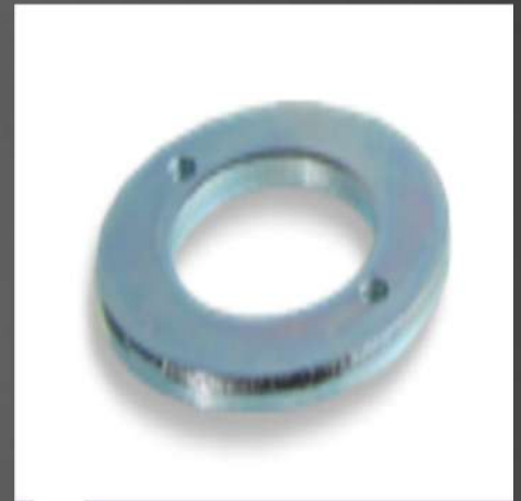
WASHER SE 7/8/SQ9