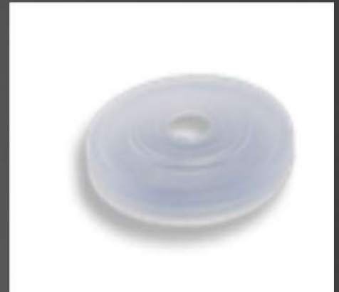
SEAL COLLAR SE 9 - 10