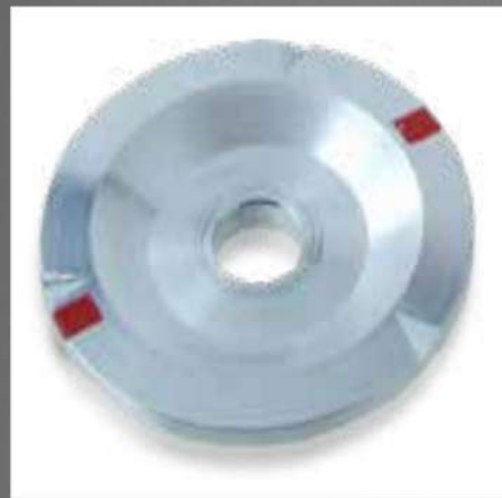
FLANED WHEEL SE 10