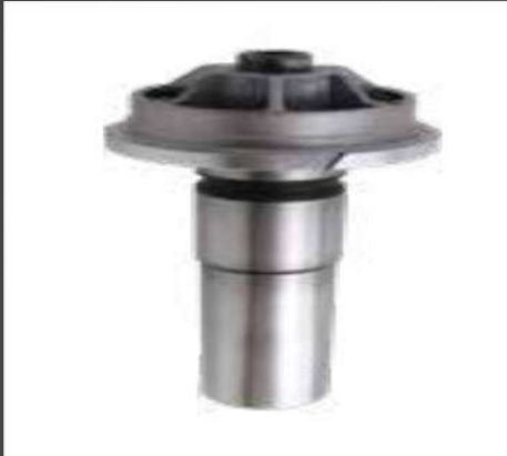
OPENING ROLLER BEARING SE