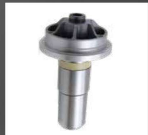
OPENING ROLLER BEARING SE 10-12