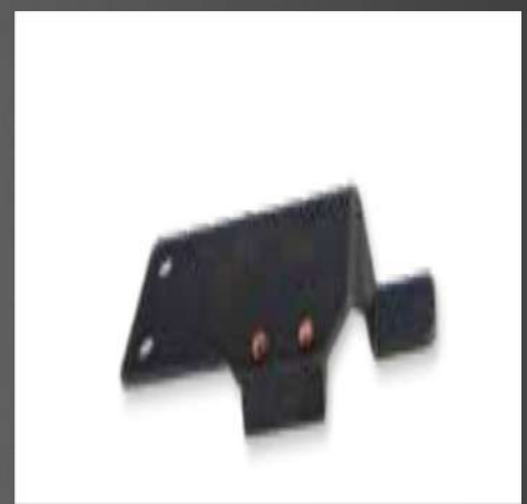
BRAKE SPRING SE 9/10/SQ9