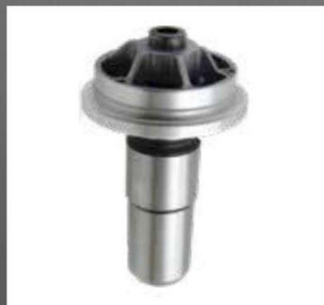
OPENING ROLLER BEARING SE 9