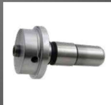
OPENING ROLLER BEARING SE 9 FG