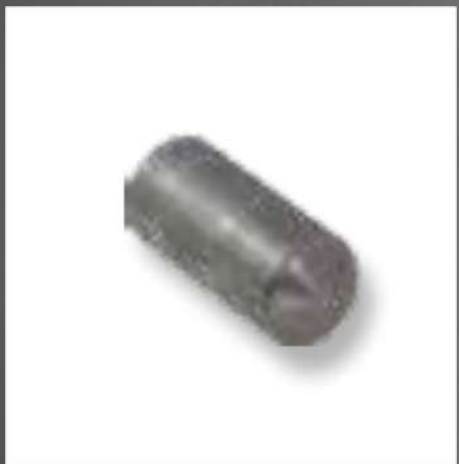
CYLINDRICAL PIN SE 7/8/9