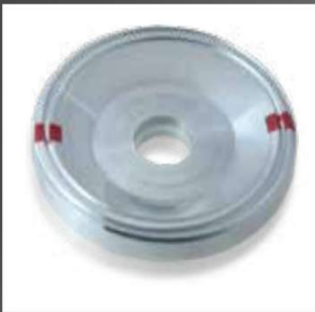
FLANED WHEEL SE7/8/9