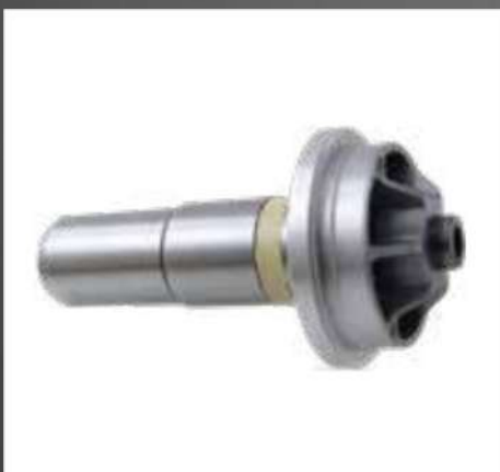
OPENING ROLLER BEARING SE 7/8