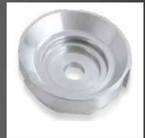
FLANED WHEEL SE/SQ