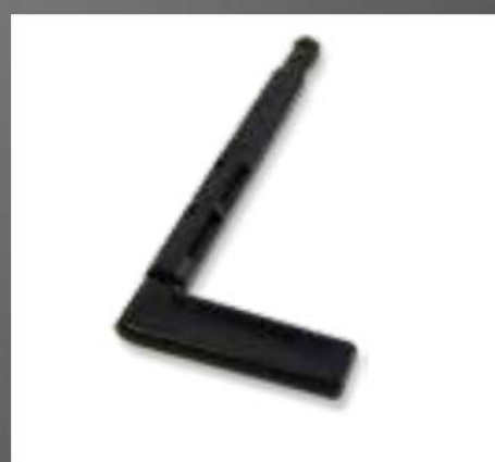
LOCKING LEVER SE11-20