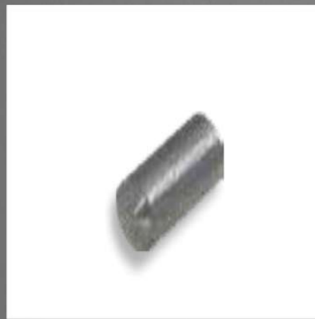
CYLINDRICAL PIN SE 10