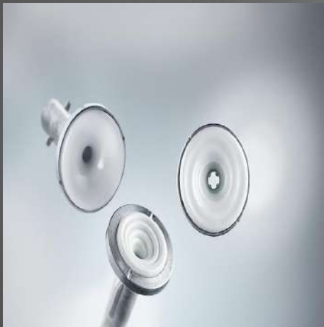
TAKE OFF NOZZLES